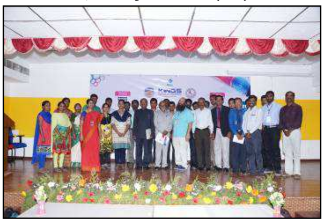
Participants of the ICETETS-2016 on 26th February, 2016